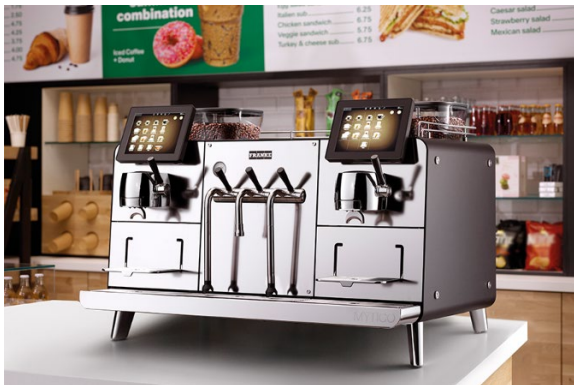
Caption 1: Mytico Due featuring a side panel in the color, Onyx. Choose your favorite look from six color options.

Downloadable files here .