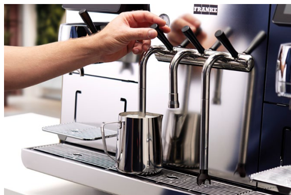
Caption 3: The Barista-Levers are customizable for quick dispense of favorite beverages or convenient functions such as steam wand purging.